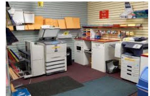
Copy center Near rooms B