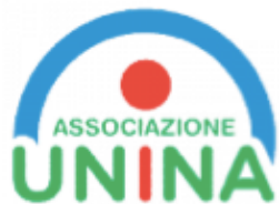
Students association UNINA