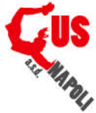
University sports center