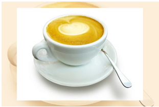
Bar Floor -1 DEMI